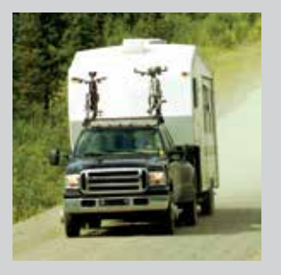
Truck Towing and Trailers