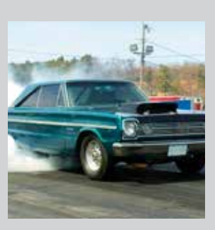
Street Rods / Circle Track