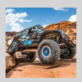
Off Road / Rock Crawlers