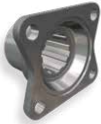
J300P SECTION 1 Companion Flanges (Part Type Number Set = 1)