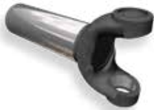
J300P SECTION 3 Slip Yokes (Part Type Number Set = 3) Splined Sleeves (Part Type Number Set = 55)