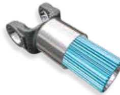
J300P SECTION 8 Yoke Shafts (Part Type Number Set = 82)