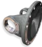
J300P SECTION 2 Flange Yokes (Part Type Number Set = 2)