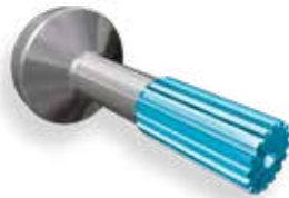
J300P SECTION 7 Tube Shafts (Part Type Number Set = 40 or 42) Midship Tube Shafts (Part Type Number Set = 53 or 54)