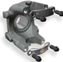
J300P SECTION 4 End Yokes (Part Type Number Set = 4)