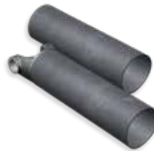
J300P SECTION 6 Tubing (Part Type Number Set = 30 or 32) Yoke & Tube Assemblies (Part Type Number Set = 27)