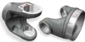
J300P SECTION 5 Tube Yokes (Part Type Number Set = 26 or 28) Center Yokes & Center Plates (Part Type Number Set = 26)