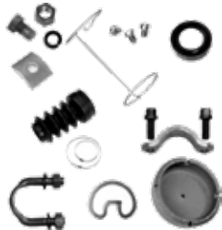
J300P SECTION 9 Miscellaneous Parts • bolts • nuts • dust caps • balance weights • keys • tube deadeners • snap rings

OLD STYLE: Identify the part by the 2nd (center) number set (as shown on the previous page) of the complete part number. In the complete part number, with the exception of Journal & Bearing Kits, Support Bearing Assemblies, Driveshaft Assemblies, and Tubing, the: