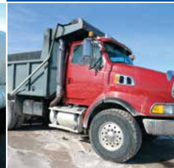
SVL Ring and Pinions: extraordinary value to keep you moving forward.

Feel confident you have selected the best aftermarket-engineered product, service, and overall value in the market—select SVL products.