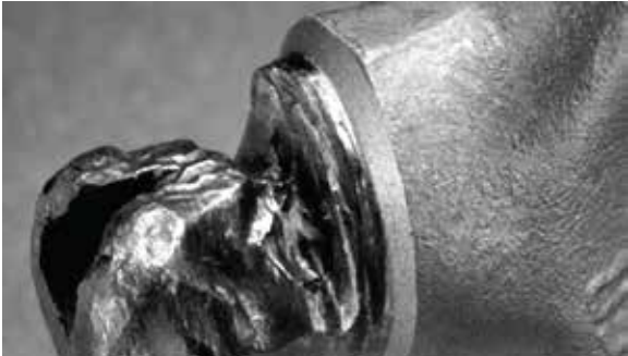
Burned U-Joint Cross